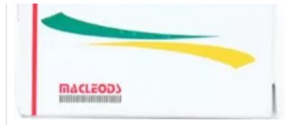
Megalis 10 mg