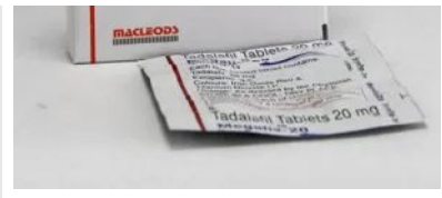
Megalis 20 mg